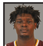
30 BURNS JR. R-Jr. ▶ Forward

MIN. 20.0 PPG 13.0 RPG 6.0 APG 2.0 FG% 60.0 3FG% 75.0